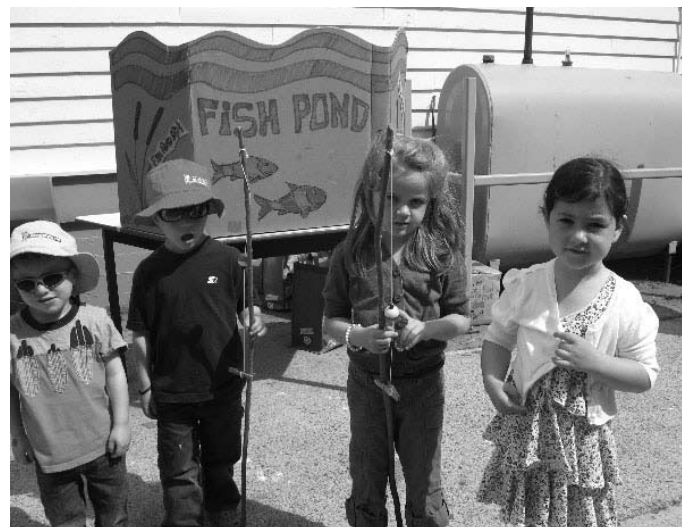
Ready for fishing at the First Family Fun Day 2011

If you have enjoyed any of these events in our church take the opportunity to thank any of these individuals. If you would like to help by volunteering your time and talent to any of the events you would be most welcome.