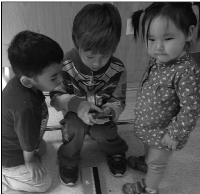
CHILDREN AT THE CHURCH

Recent projects have included: supporting and collecting signatures for the Blue Dot Movement and supporting SAFE toward sponsoring a Syrian refugee family.