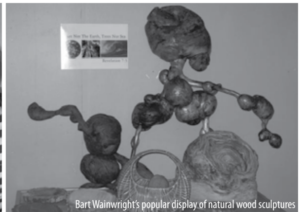
Bart Wainwright's popular display of natural wood sculptures