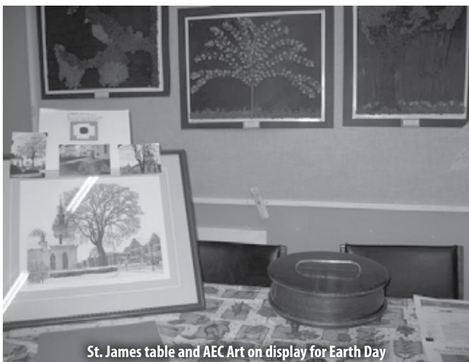
St. James table and AEC Art on display for Earth Day