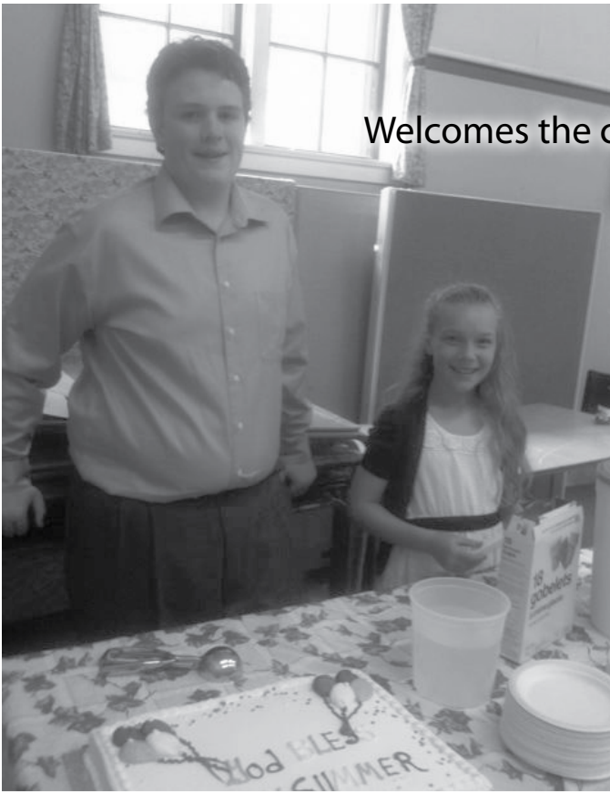
Sunday School Welcomes the coming of Summer