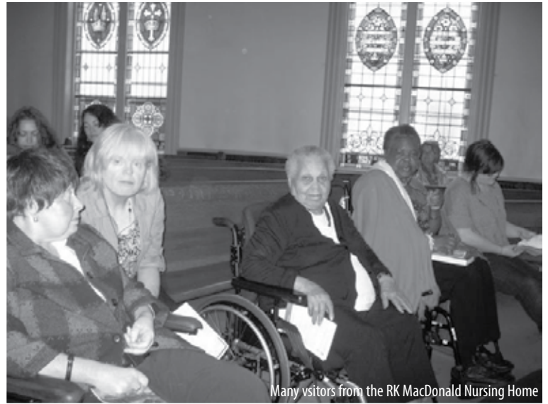
Many visitors from the RK MacDonald Nursing Home