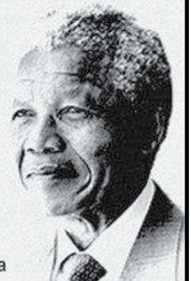
- Nelson Mandela

Poverty is not an accident. Like slavery and apartheid, it is man-made and can be removed by the actions of human beings.